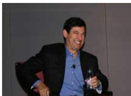
Jim Breyer , Accel Partners, Managing Partner