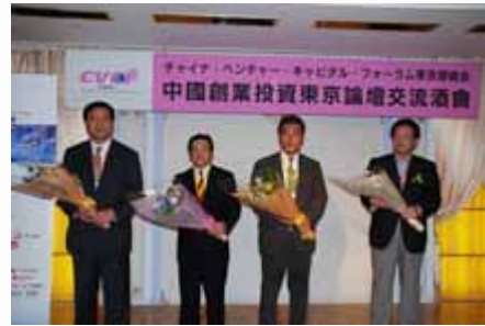
颁奖典礼 awarding ceremony