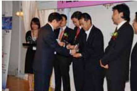
颁奖典礼 awarding ceremony