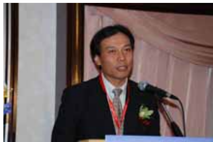
主题演讲 Keynote speech