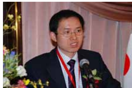
主题演讲 Keynote Speech