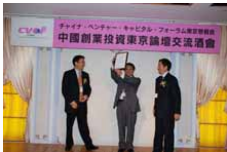
颁奖典礼 awarding ceremony