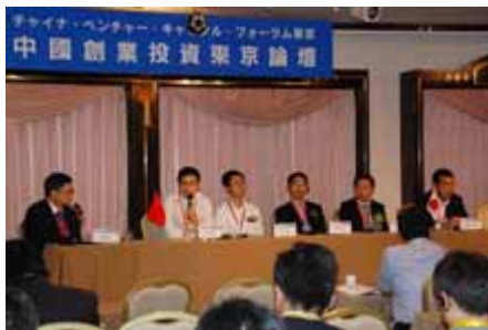
专家组讨论 Panel Discussion