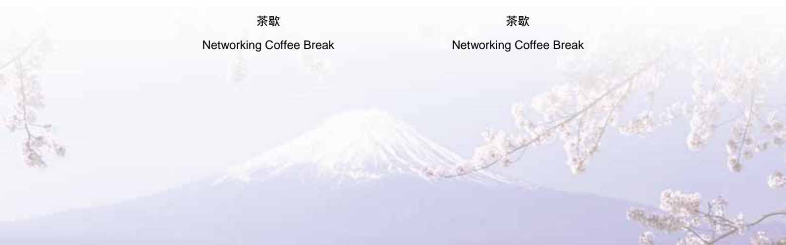
Networking Coffee Break