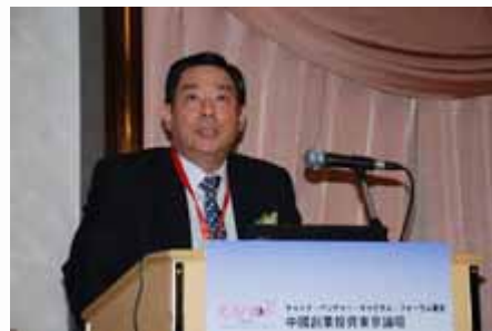
主题演讲 Keynote speech