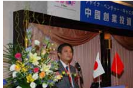
主题演讲 Keynote Speech