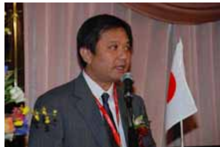
主题演讲 Keynote Speech