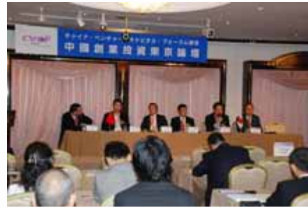
专家组讨论 Panel Discussion