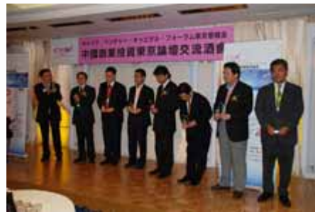
颁奖典礼 awarding ceremony