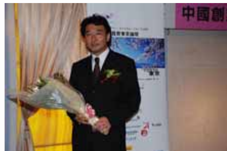
颁奖典礼 awarding ceremony