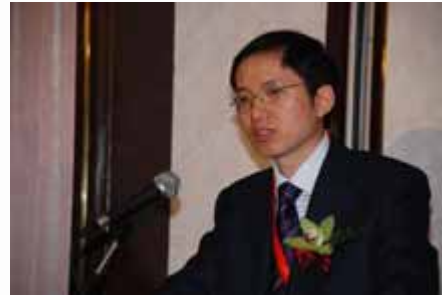
主题演讲 Keynote Speech