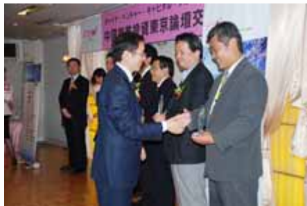
颁奖典礼 awarding ceremony