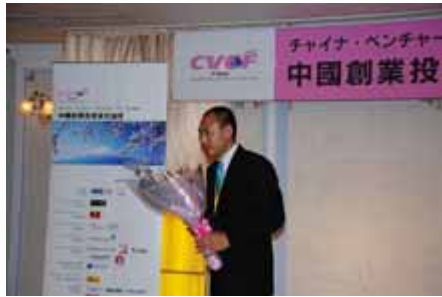
颁奖典礼 awarding ceremony