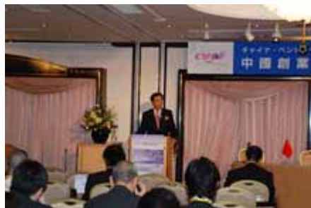
主题演讲 Keynote speech