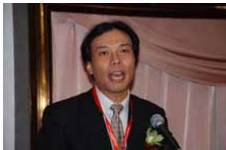
主题演讲 Keynote speech