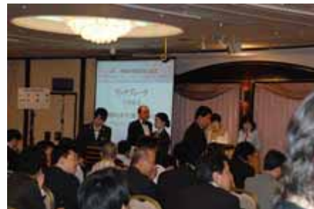
商务午餐 Speech during lunch