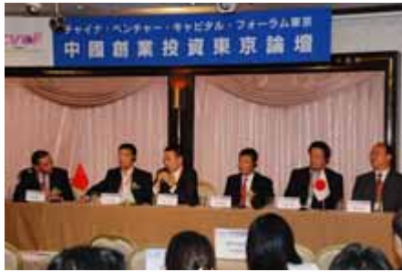
专家组讨论 Panel Discussion