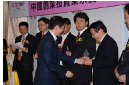
颁奖典礼 awarding ceremony