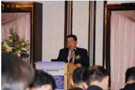
主题演讲 北尾吉孝, SBI, 董事长 CEO Yoshitaka Kitao, SBI, Representative Director CEO

Keynote speech 3: How to find a future global first-class enterprise in China?