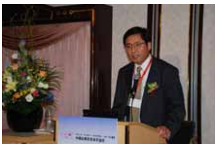
主题演讲 Keynote speech