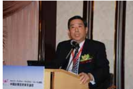
主题演讲 Keynote speech