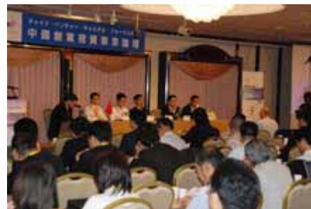
专家组讨论 Panel Discussion