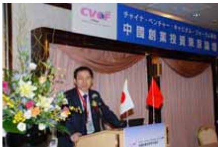
主题演讲 Keynote Speech