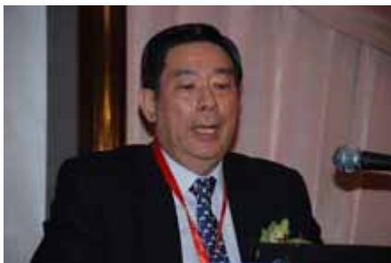
主题演讲 Keynote speech