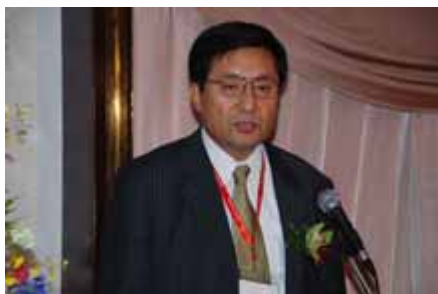
主题演讲 Keynote speech