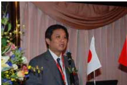
主题演讲 Keynote Speech