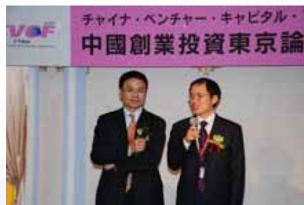
晚宴致辞 Dinner speech