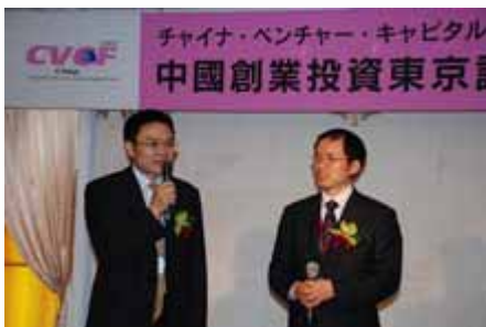
晚宴致辞 Dinner speech