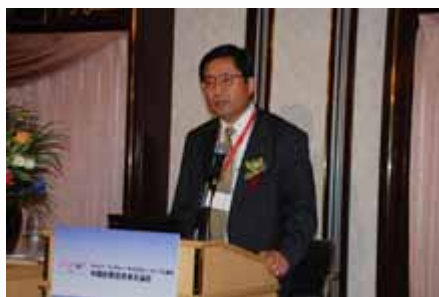
主题演讲 Keynote speech