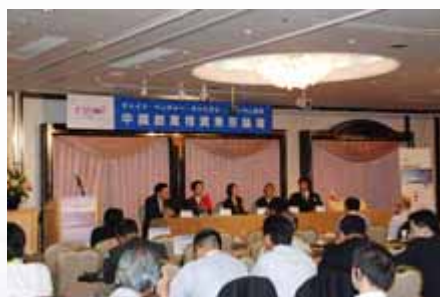
专家组讨论 Panel Discussion