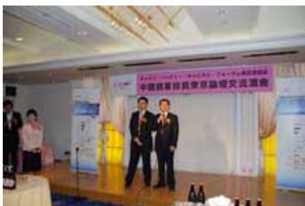
晚宴致辞 Dinner speech