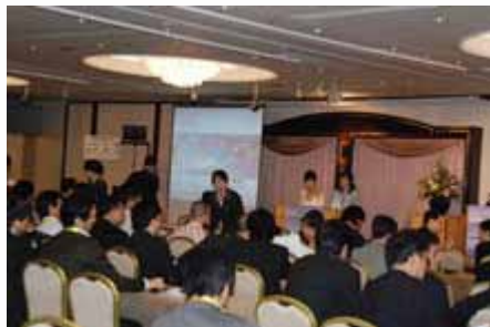
商务午餐 Speech during lunch