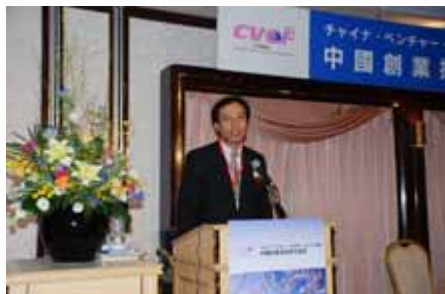
唐骏，盛大网络，总裁 Tang Jun, Shanda Entertainment, President