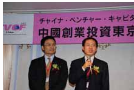
晚宴致辞 Dinner speech